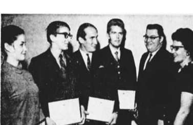
Two of the adults (right) rescued from their capsized boat meet four of the people who responded to the emergency, each holding a Red Cross Lifesaving Award.

When a boat carrying eight people capsized on the Missouri River, five strangers came to the rescue. The four adults and four children on the powerboat were thrown overboard. Two of the children were caught under the overturned craft, requiring immediate CPR. When the survivors finally met some of their rescuers at the Red Cross Lifesaving Award ceremony, they thanked their heroes for the “miracle” of their two daughters’ lives, both of whom have fully recovered.